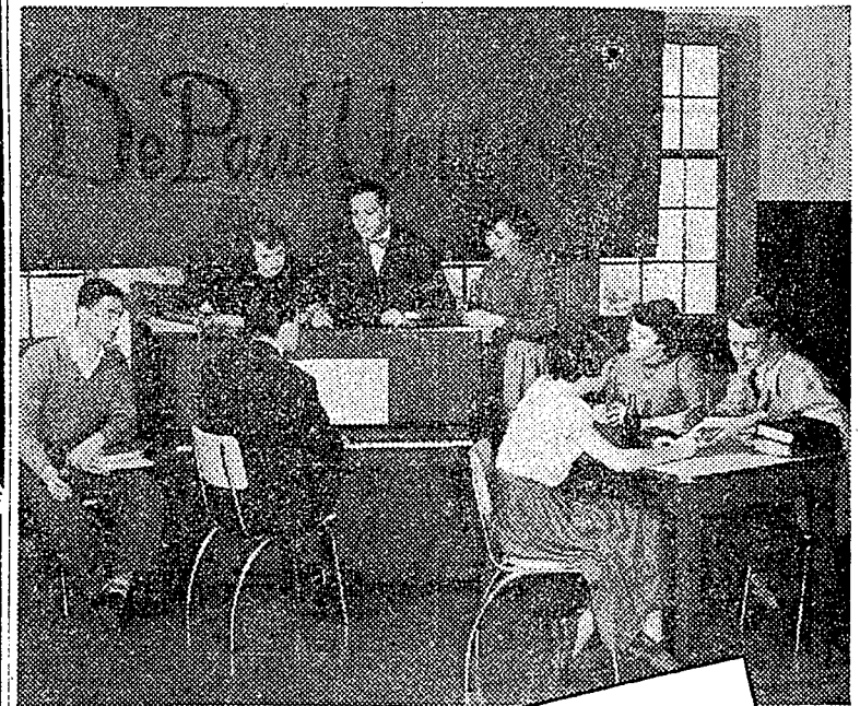
Wangler Hall DePaul University Chicago, Illinois