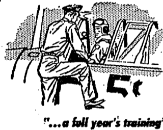
"...a full year's training"