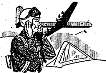
"...get going fast"

So... FIREWALL IT! NEEDLE IT! CROWD THE MACH!