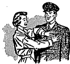
"...earn your wings"