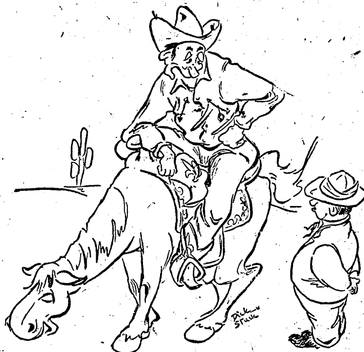
"Am 'ah now or have 'ah ever been a member of what?"