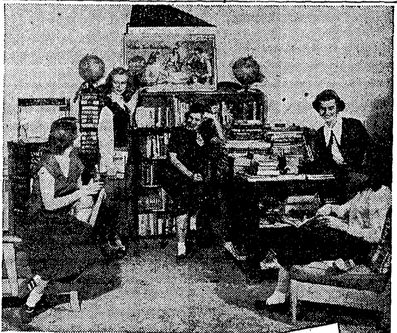
Book Store Texas Technological College Lubbock, Texas

THE TOREADOR Baccalaureate Speaker Announced