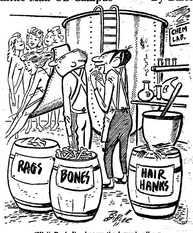
"Well, Prof., I've known the formula all my life — guess nobody ever tried it before."