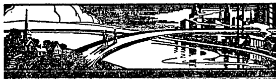
THE WESTMINSTER FOUNDATION AT THE PENNSYLVANIA STATE COLLEGE