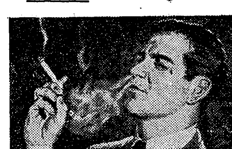
Light up your present brand Do exactly the same thing—DON'T INHALE. Notice that bite, that sting? Quite a difference from PHILIP MORRISI

Other brands merely make claims—but Philip Morris invites you to compare, to judge, to decide for yourself. Try this simple test. We believe that you, too, will agree . . .