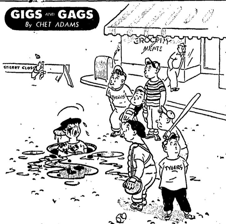
"Allright, Who's the wise guy what swiped the cover offa second base?"