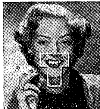
R. J. Reynolds Tobacco Co. Winston-Salem, N. C.

Not one single case of throat irritation due to smoking CAMELS