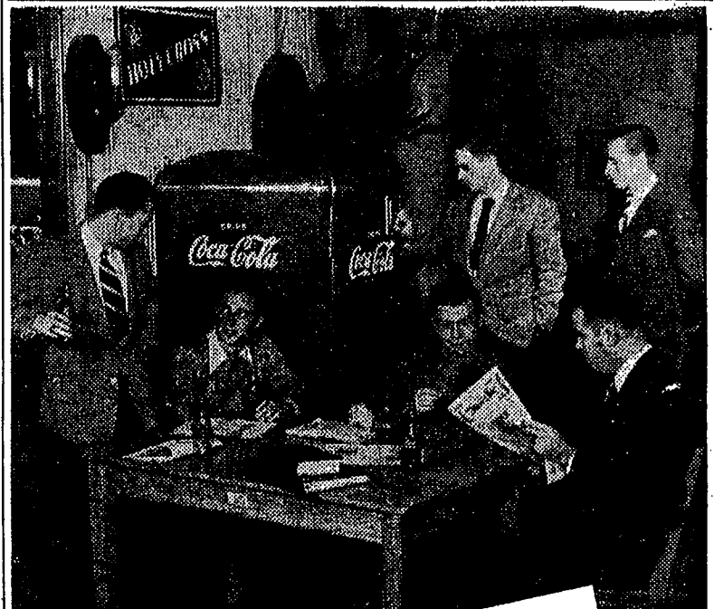
Day Room College of the Holy Cross (Worcester)