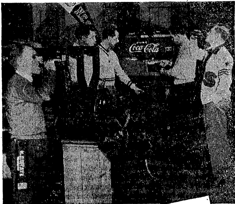
Textile Department North Carolina State College

*Confirmed in signed statements by thousands and thousands of smokers all over America!