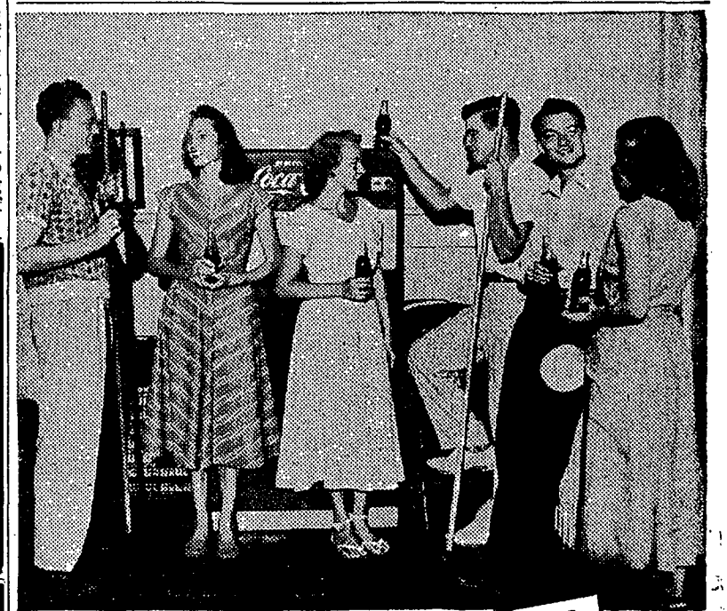
Rebel Grill University, Mississippi (Oxford)