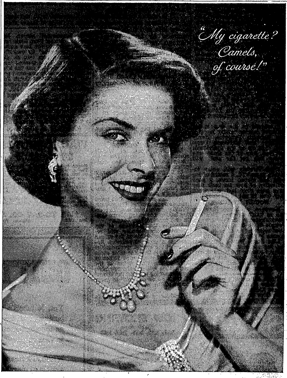
WITH SMOKERS WHO KNOW...IT'S