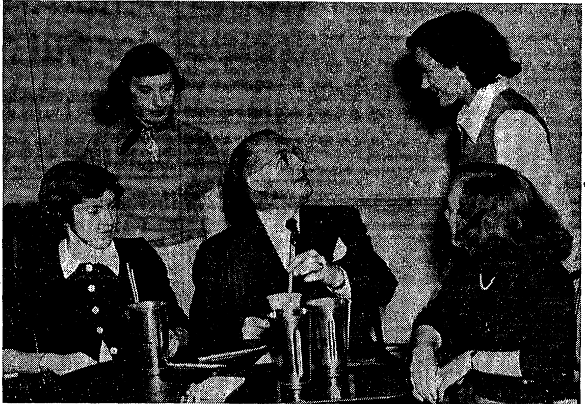
—Penn State Photo Shop