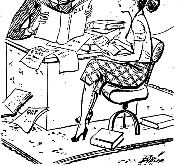
"Copy this one, Miss Slerp. It's sub-foot note 'B' under footnote No. 4. -Make it a discussion question worth 20 points."