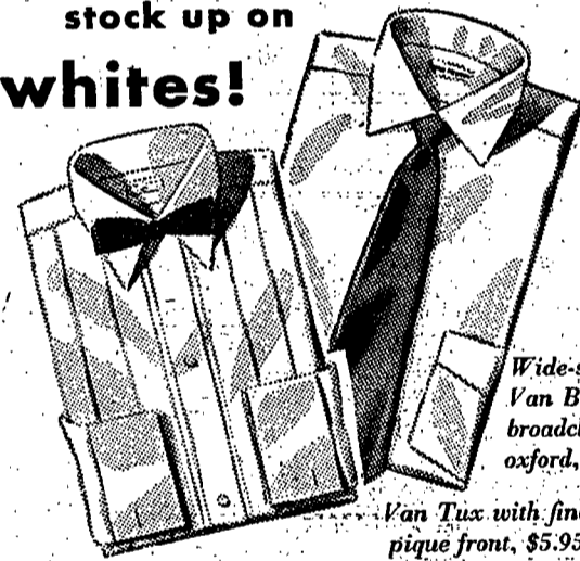
Wide-spread Van Britt in broadcloth or oxford, $3.65