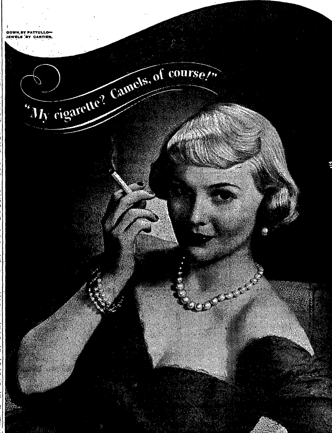
DOWN BY PATULLO—JEWELS BY CARTIER.