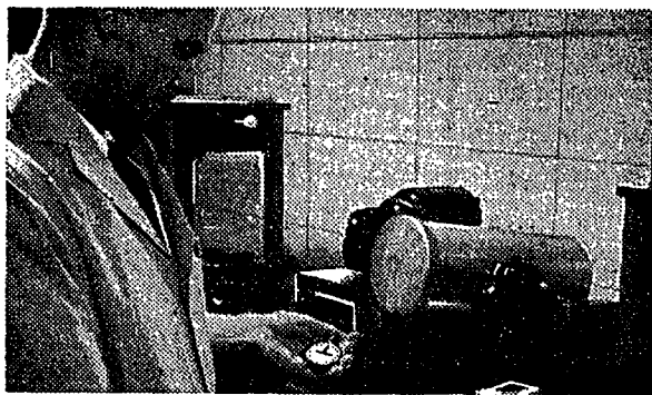
So round, so firm, so fully packed. Typical of many devices designed to maintain standards of quality, this mechanism helps avoid loose ends... makes doubly sure your Lucky is so round, so firm, so fully packed.