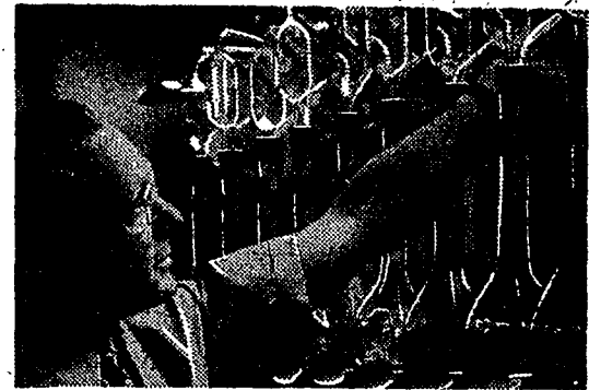
Testing tobacco. Samples from every tobacco-growing area are analyzed before and after purchase. These extensive scientific analyses, along with the expert judgment of Lucky Strike buyers, assure you that the tobacco in Luckies is fine!

Armed with this confidential, scientific information—and their own sound judgment—these men go after finer tobacco. This fine tobacco—together with scientifically controlled manufacturing methods—is your assurance that there is no finer cigarette than Lucky Strike!