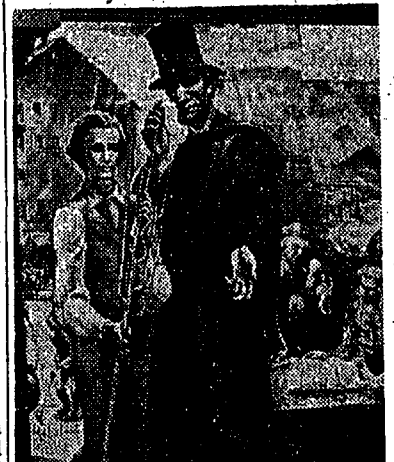
Old Main Mural

Spotches of paint decorating the ceiling above the murals in Old Main are evidence of experimentation with color schemes to