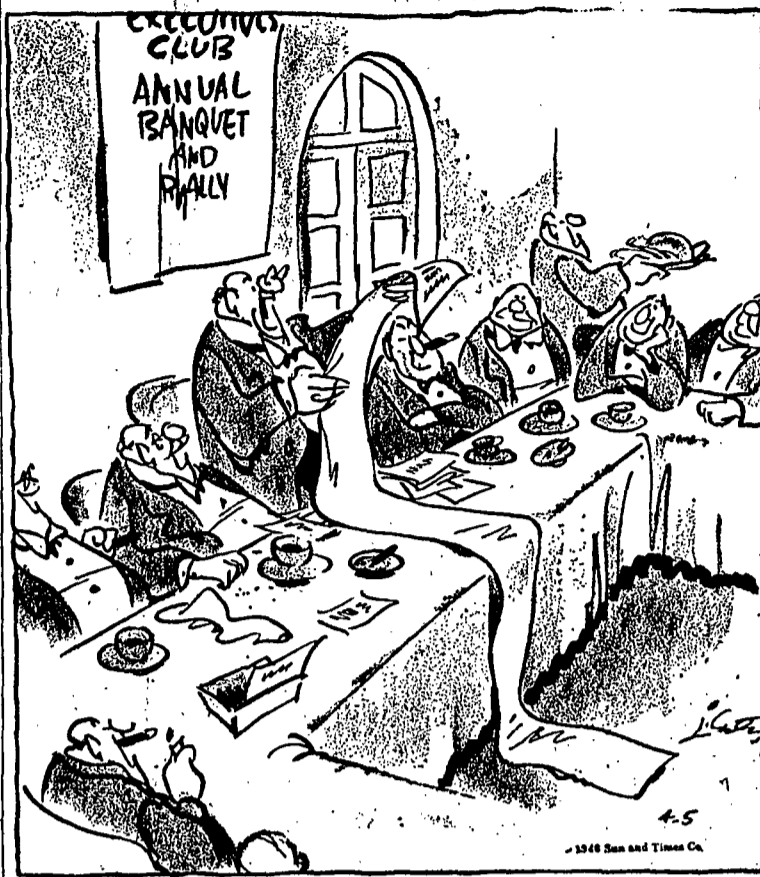
"—And here's a telegram from Senator Snort: 'Regret unable to attend stop reminded funny story about traveling salesman'—"