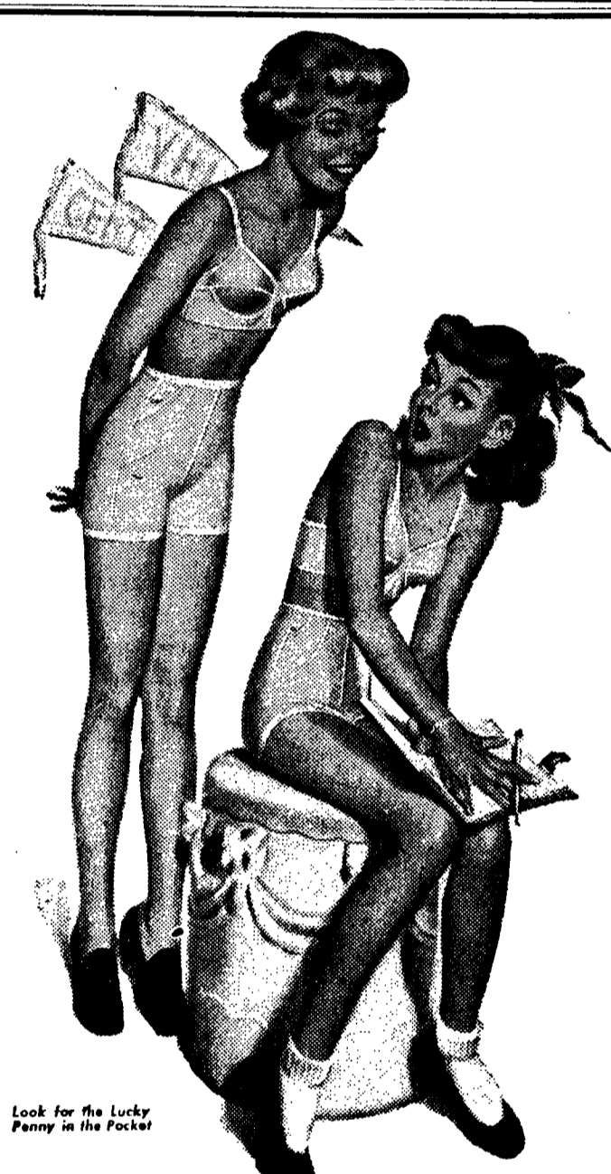
Look for the Lucky Penny in the Pocket