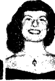
Diver (S) Sec.-treas.