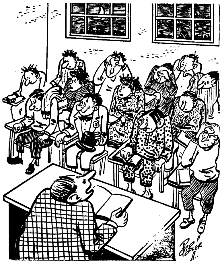
"Gentlemen, I know it takes time to get used to these 8 o'clocks."