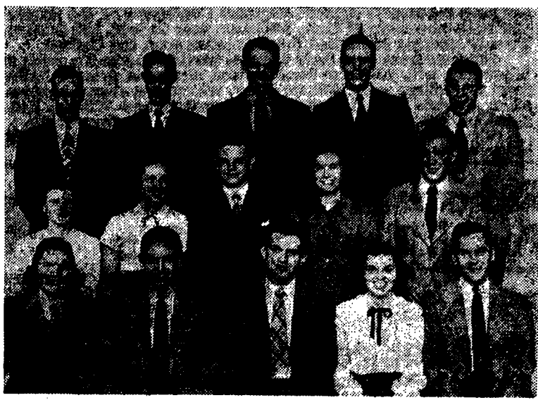
MEMBERS OF THE ALL-STUDENT CABINET

A new project of the cabinet will be a Sunday afternoon firesite session, at which members may discuss various religious matters as they pertain to the association. By this means they hope to bring cabinet members closer together than business meet-