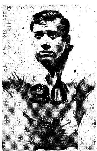
day with his original flash and abandon.

This afternoon's contest is expected to have a decided effect on the race for Eastern supremacy, as well as writing fins to one of the East's unmarred streaks.