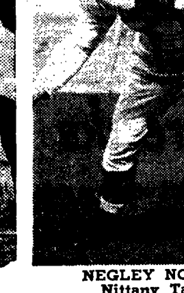
NEGLEY NORTON Nittany Tackle