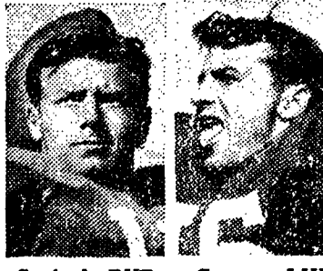
Guerre, LHB Speigel, RHB