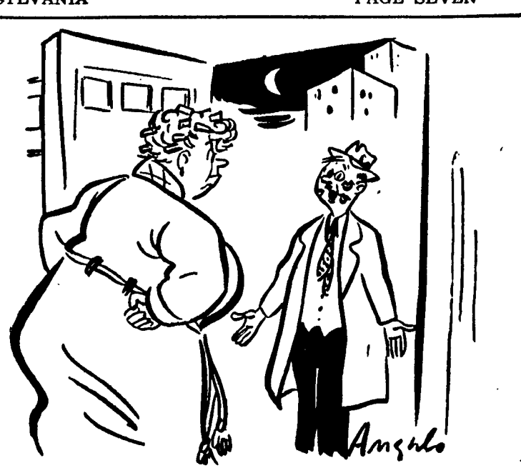
"If I tell you the truth, dear, you'll only think I'm bragging."