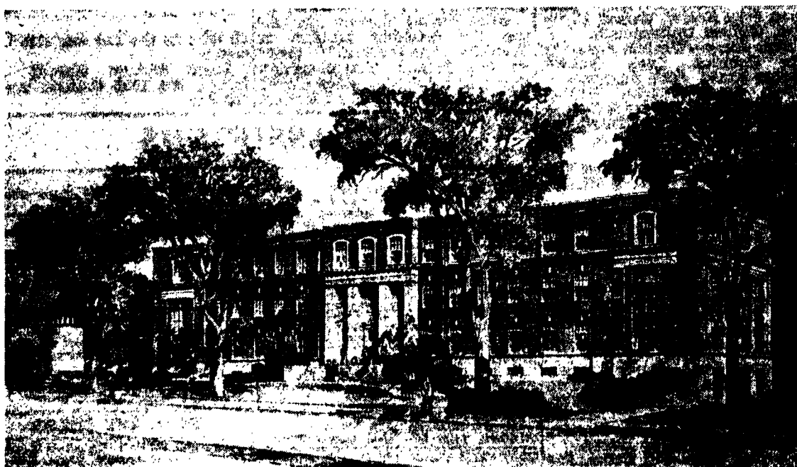
New Plant Industries Building, Ag Hill