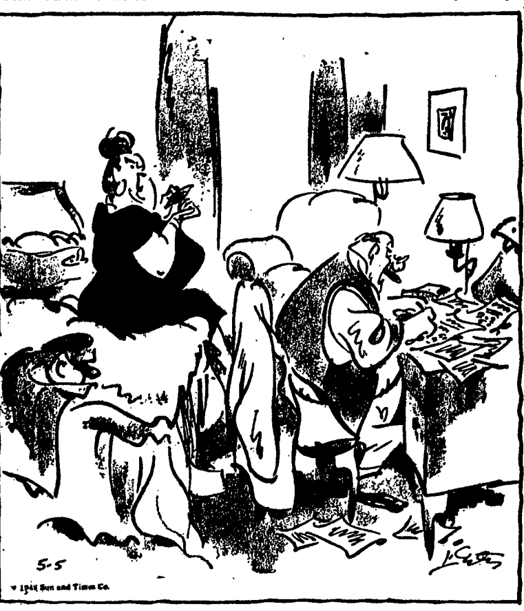
"This is the last time I go along on your business trips—you're always busy seeing a customer or juggling your expense account!"

pany, May 14, eighth semester sales work, 228 Sparks 7 p.m., men in EE, ME, IE, Chem, Chem May 11. Arrangements for indi-Eng.