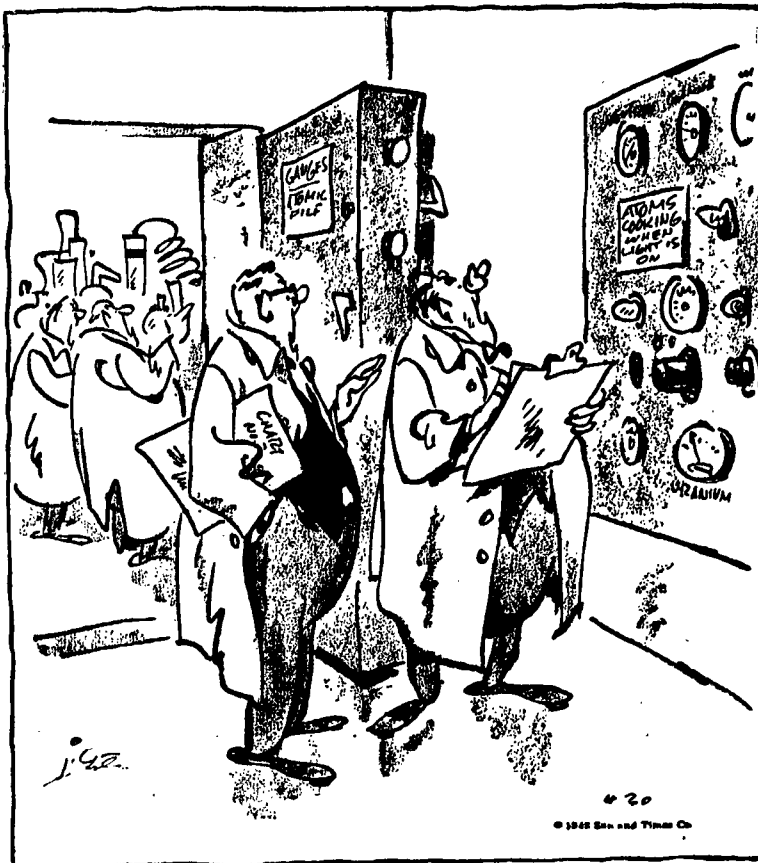
"If there's a draft I'll go into some outfit like the infantry—none of this Atom bomb combat duty for me!"