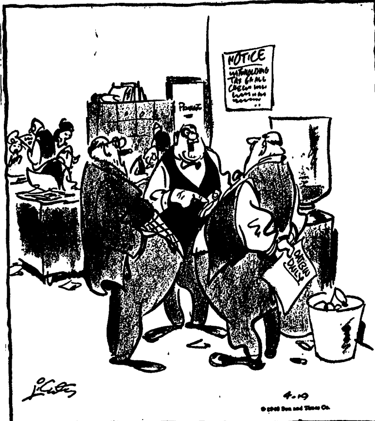
"As I told the wife, that's the best feature of the new community property law on income tax—she has to give me half of what I make!"