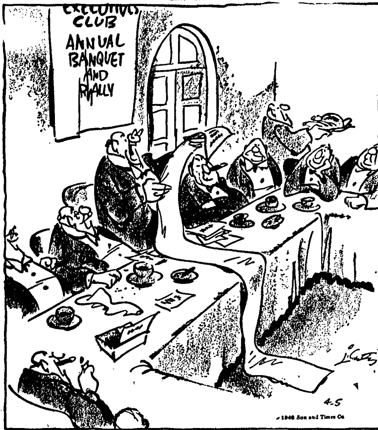
"—And here's a telegram from Senator Snort: 'Regret unable to attend stop reminded funny story about traveling salesman!'"