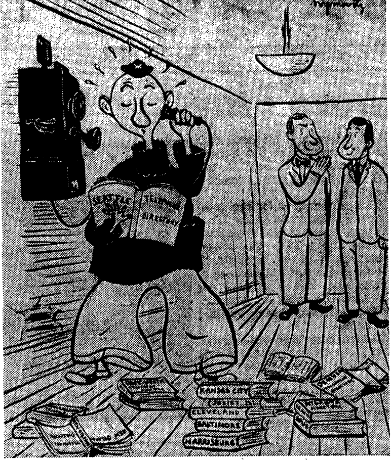
"Some fellows really go to a lot of trouble to get an import!"