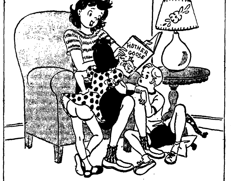
"Golly, this is better than Brother's Froth!"

A nation-wide survey shows that Chesterfields are TOPS with College Students from coast-to-coast.