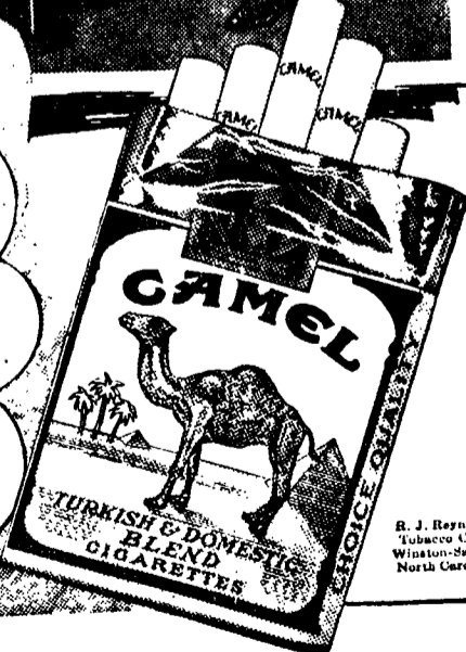
R. J. Reynolds Tobacco Co., Winston-Salem, North Carolina

Nothing suits me like a CAMEL . I've smoked them for years!