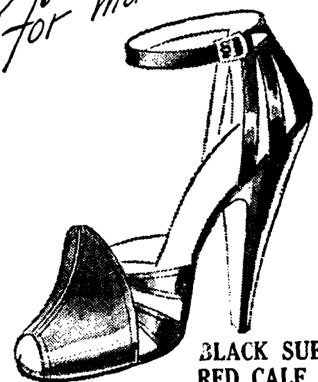
BLACK SUEDE RED CALF $16.95