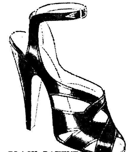
BLACK PATENT BROWN CALF $15.95

Under cover and/or out in the open... how will you have your new Mademoiselle look? Come choose from shoes with a toe on show... an instep a-whirl with straps... or heels that dare to bare or close demurely. Definitely, for the young and young in heart. mademoiselle, you'll love to be in our shoes.