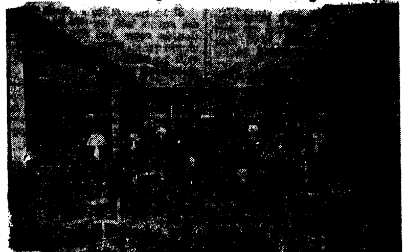
THE LOUNGE is furnished with comfortable chairs, reading lamps, thick carpets and tables. Entrance to the ballroom is made through the pictured doorways to the right and left of the fireplace.