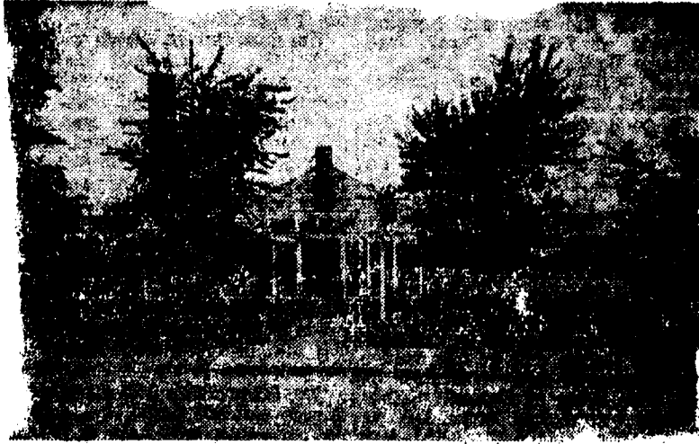
THE RECENTLY acquired Penn State Student Activities building will be completed in February. Pictured above is the front entrance which leads into the main lounge. The ballroom is located in the rear of the building.