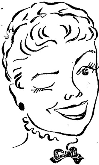
Pictured above is Mama of the Players show "I Remember Mama," which will be given in Schwab Auditorium tonight, tomorrow afternoon, and tomorrow night at 8 o'clock.