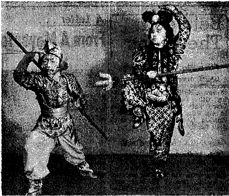
TWO OF THE 14 musicians and players who will appear in "An Evening in Cathay," the Artists' Course dividend program appearing in Schwab Auditorium at 8 o'clock tomorrow evening. Admission is by ticket stub from last evening's concert.