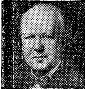
WALTER S. GIFFORD President of the American Telephone and Telegraph Company. Started as a clerk with the Western Electric Company in 1904.