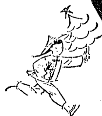
CHEN YU Costume Set

A whole wardrobe of beautiful Chen Yu nail lacquers to go with all her moods. $150* Hi-Fashion Costume Set. $700*