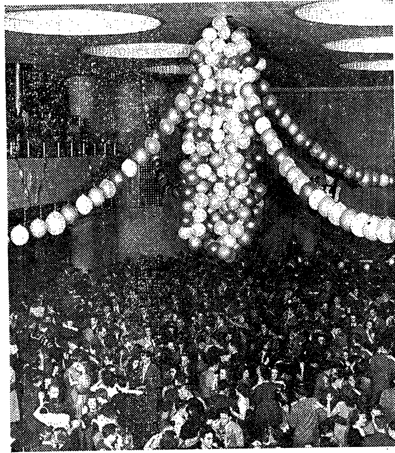
Students at the University of Minnesota hold their dances in the main ballroom of the famous Coffman Memorial Union, one of the newest Student Unions in the country. Penn State Architectural students included a ballroom when they drew up plans for a Union on this campus.