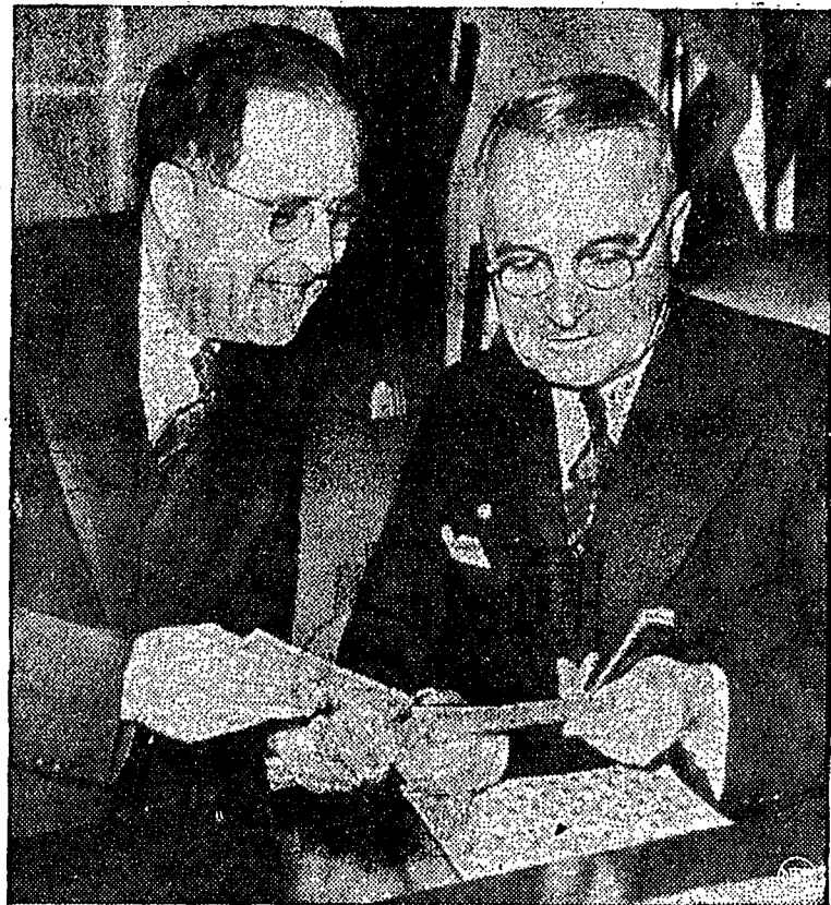
President Truman buys the first 1945 Christmas seals to start 39th annual sale sponsored by National Tuberculosis Association. The salesman is Secretary of Agriculture Clinton P. Anderson, long active in tuberculosis control work. Seals will be sold to the public from Nov. 19 until Christmas.