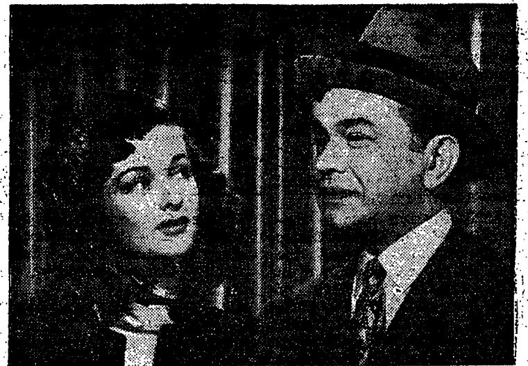
Joan Bennett and Edward G. Robinson are co-starred in RKO Radio's thrilling adventure, "The Woman in the Window," with Raymond Massey, which opens at the State Monday.

The test flower garden at the College is one of 15 All-American trial grounds in the United States.