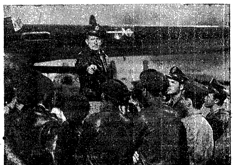
Spencer Tracy, as Lt. Col. Jimmy Doolittle, gives a last-minute briefing in this scene from "30 Seconds Over Tokyo," a factual thrillation!