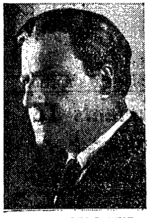
DR. STEPHEN S. WISE