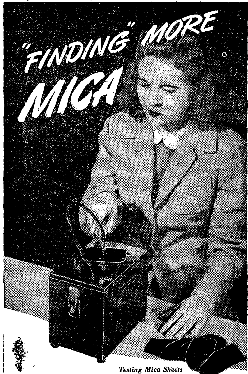
Testing Mica Sheets

President of the honorary is (Continued on page eight)