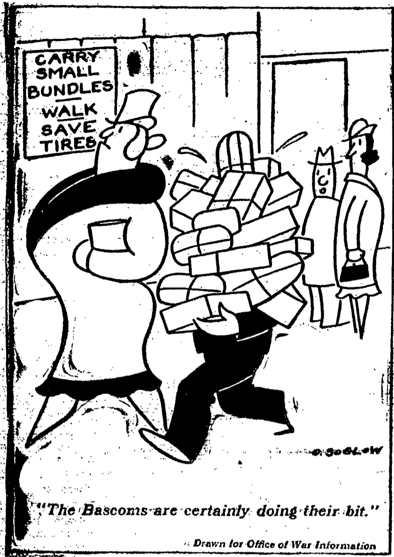
Drawn for Office of War Information