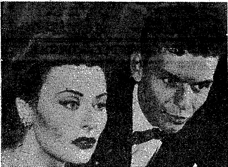
Michele Morgan and Frank Sinatra are co-starred with Jack Haley in the newest and greatest musical, "Higher And Higher," with Leon Errol.